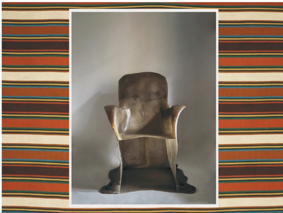
Kar Studio, Element Chair

Future Relics at Palazzo Corsini al Prato