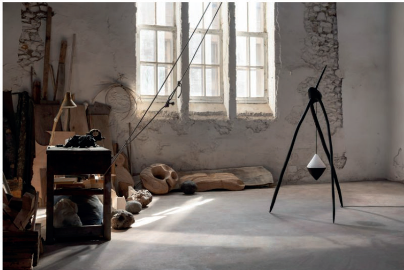
The Compass floor lamp takes the form of a tripod