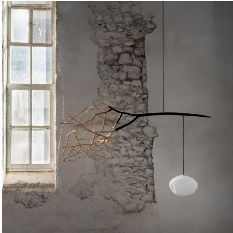
Many of the works, such as the Icarus pieces, are suspended mobiles